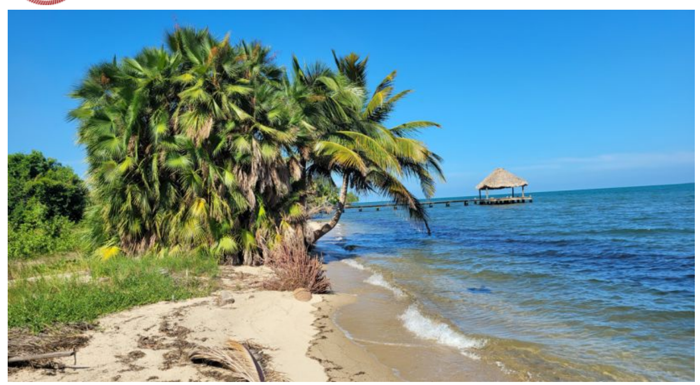
L637 – DEVELOPMENT READY BEACH TO LAGOON LOT IN PLANTATION