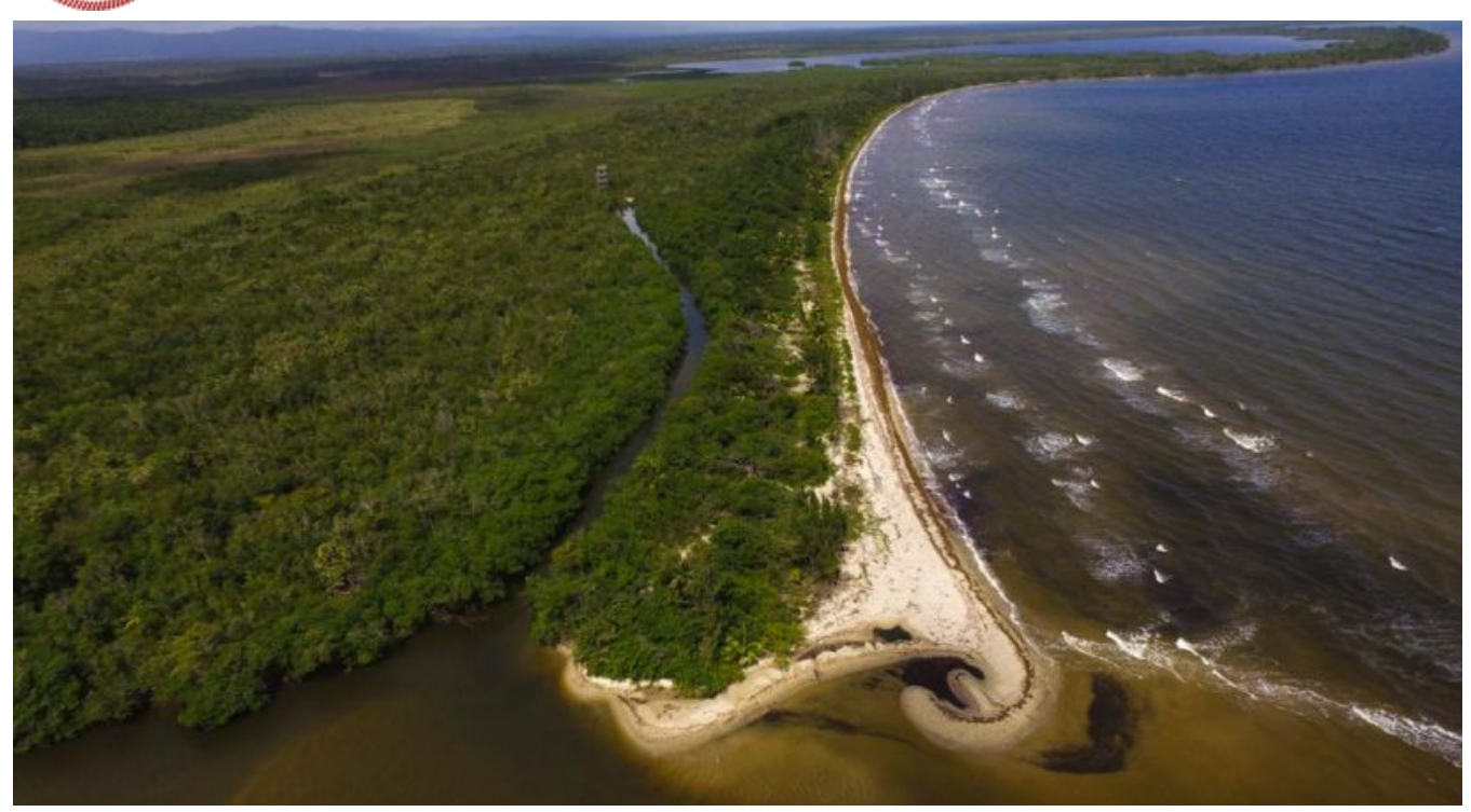
D268 - INVESTMENT OPPORTUNITY 3000 FEET OF BEACHFRONT PROPERTY, HOPKINS, BELIZE