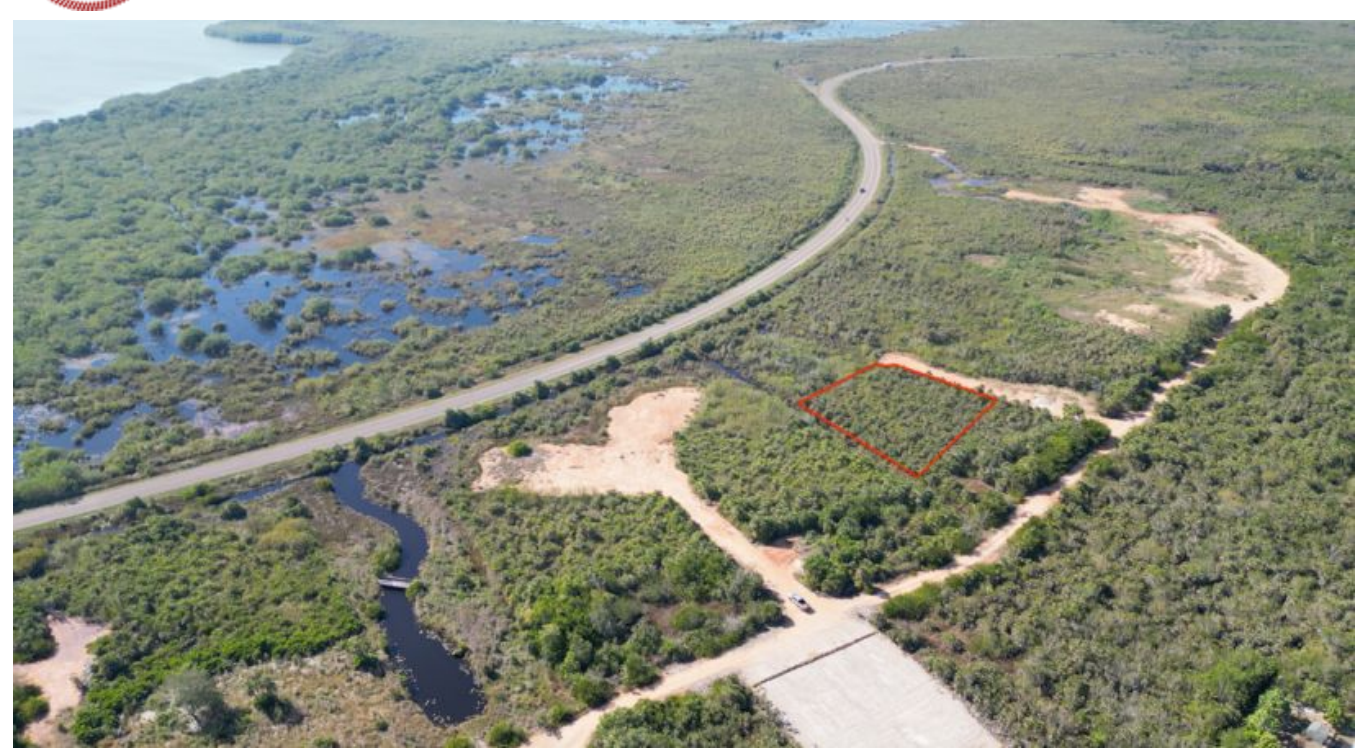
L605 – NEW RESIDENTIAL-CARIBBEAN WAY LOT FOR SALE! LOT NO. 427