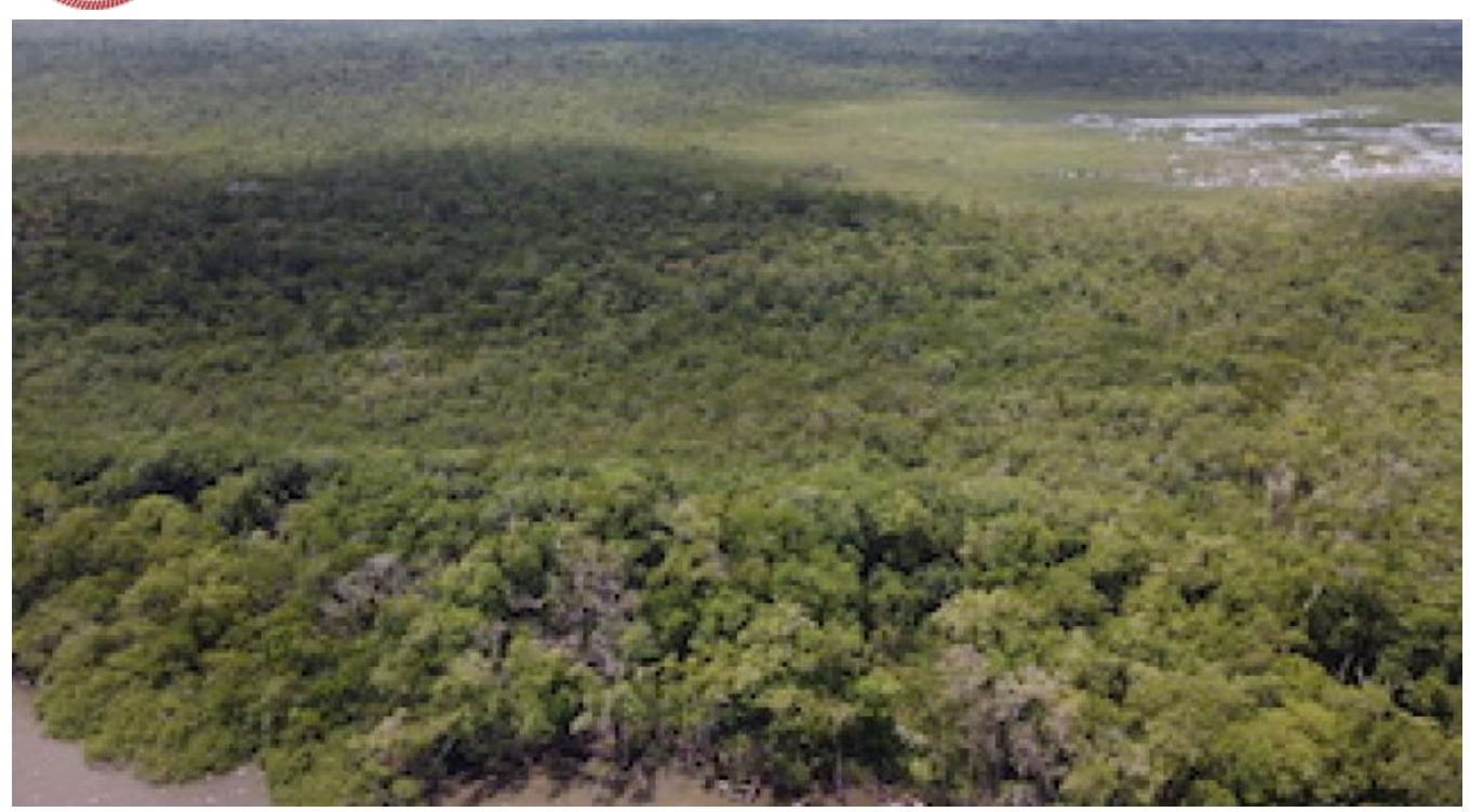
\ensuremath{\mathsf{D258}} - 177 ACS CARIBBEAN SEA PROPERTY IN CATTLE LANDING AREA, TOLEDO DISTRICT