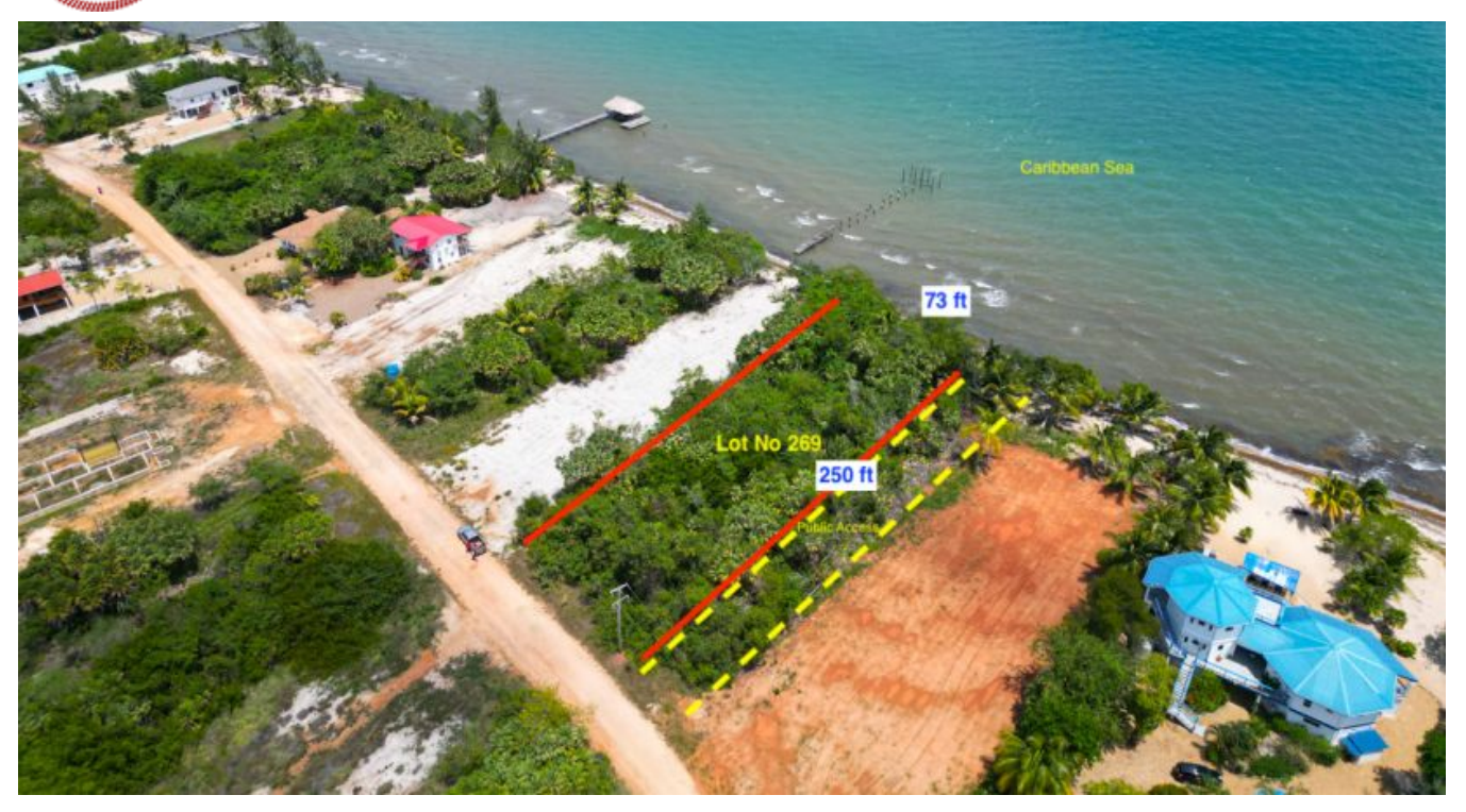
L593 - BEACHFRONT LOT FOR SALE IN THE EXCLUSIVE CARIBBEAN WAY COMMUNITY, PLACENCIA PENINSULA, BELIZE