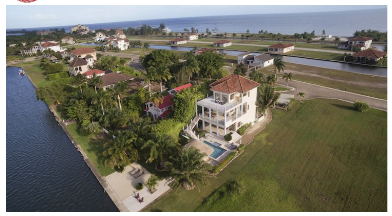
H497 - LAGUNA GECKO – WATEFRONT LUXURY LIVING