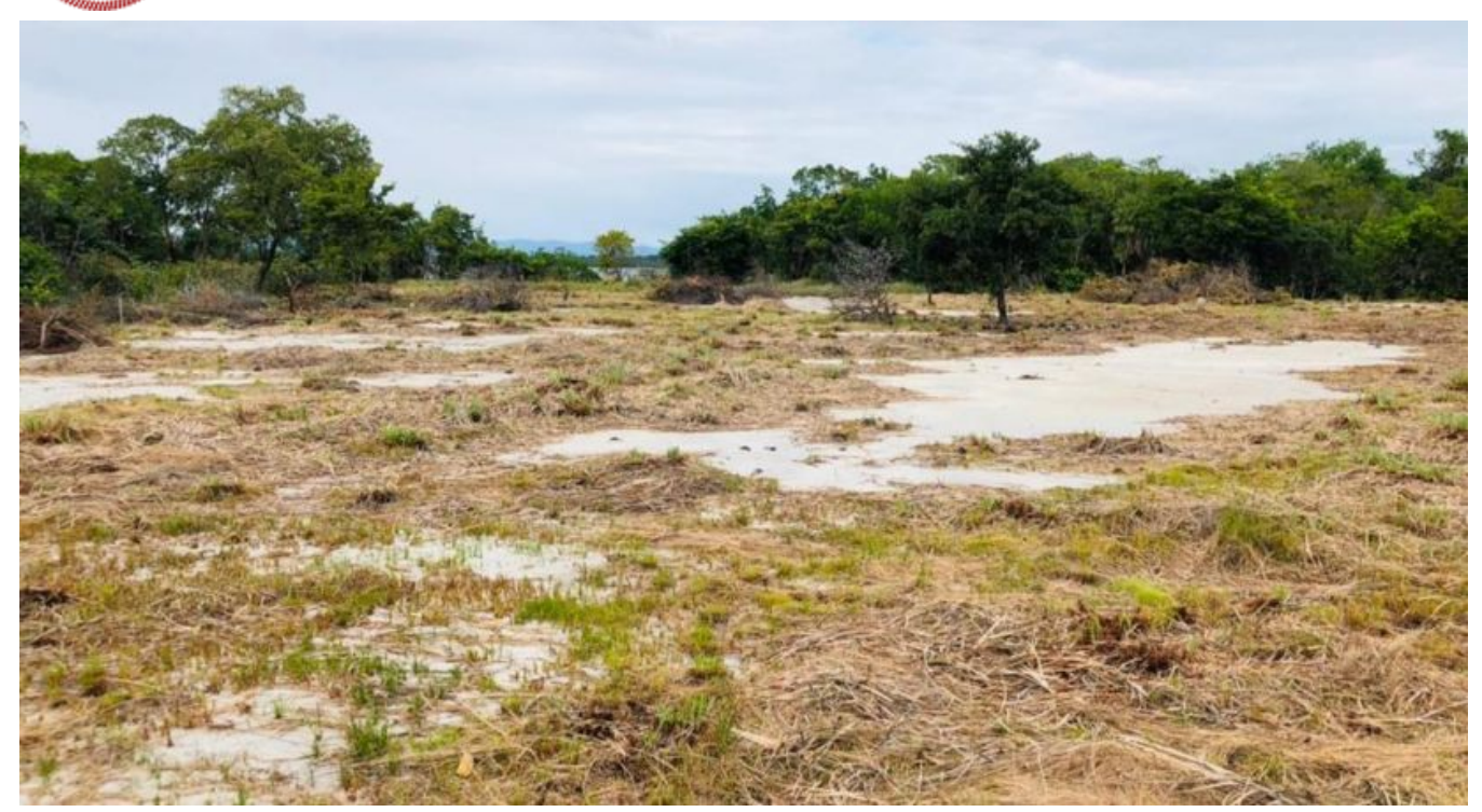
L583 - PLANTATION RESIDENTIAL ROAD FRONT LOT NO. 4 FOR SALE, PLACENCIA PENINSULA