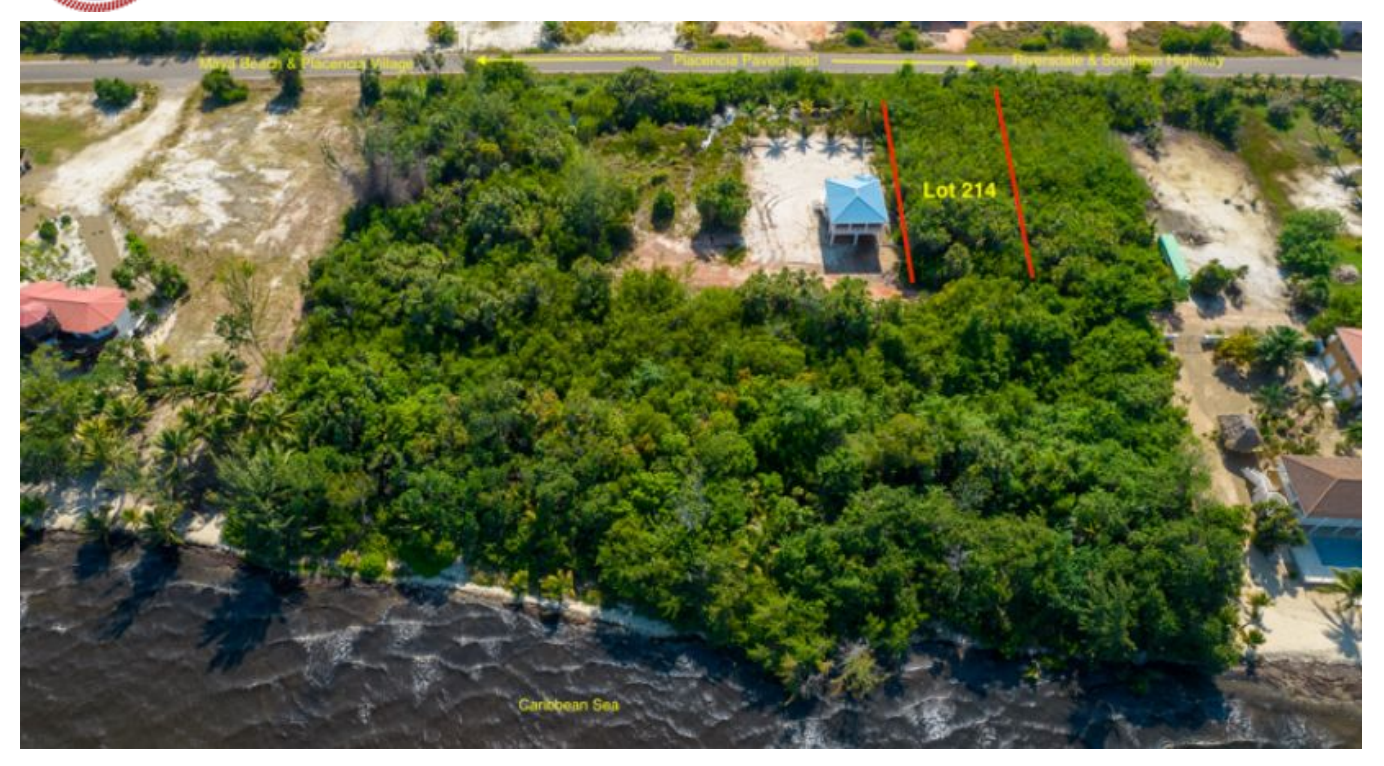
L564 - OCEAN VIEW RESIDENTIAL IN CARIBBEAN WAY - LOT NO. 214