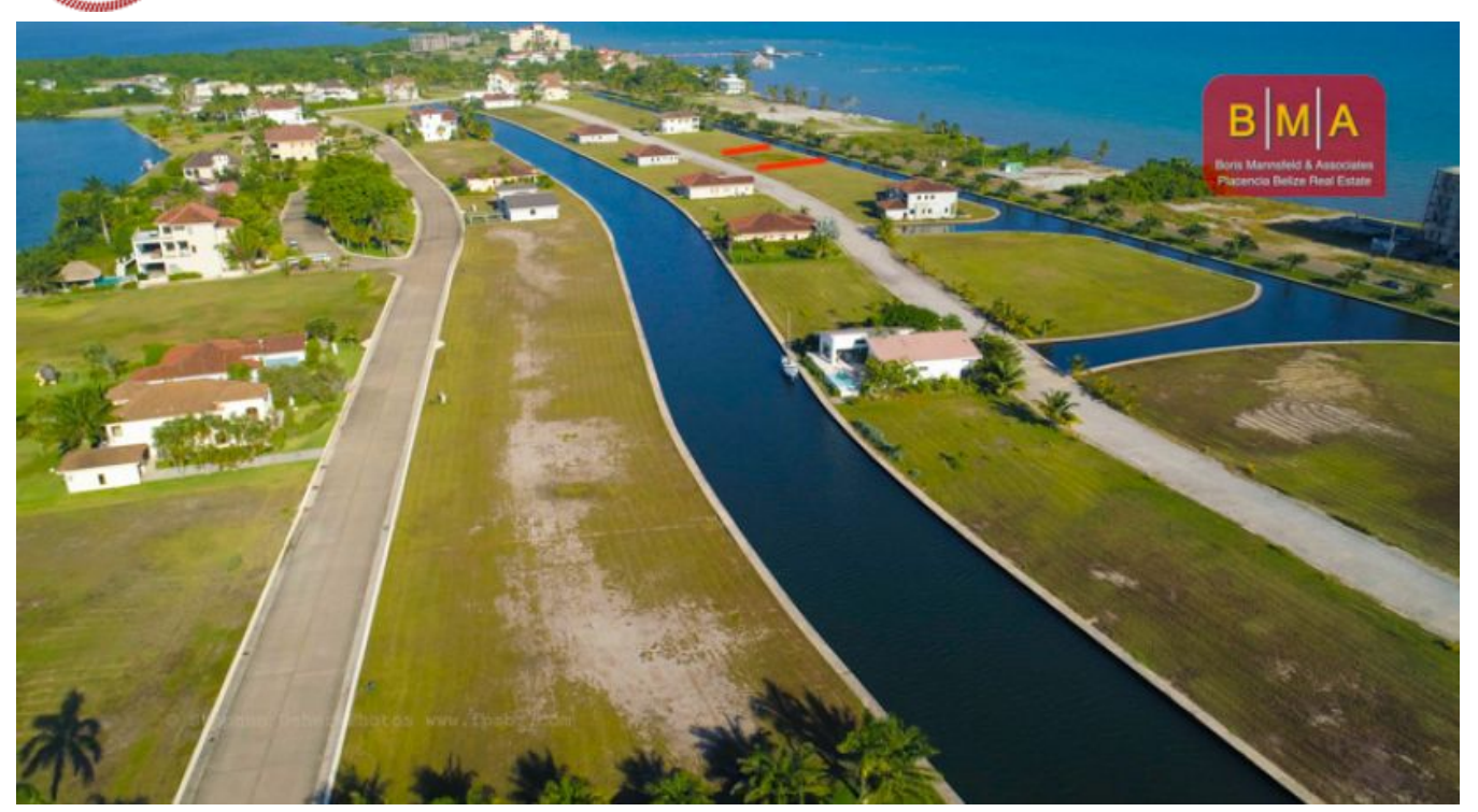
L559 – THE PLACENCIA RESIDENCES – OCEAN VIEW PARCEL 2221