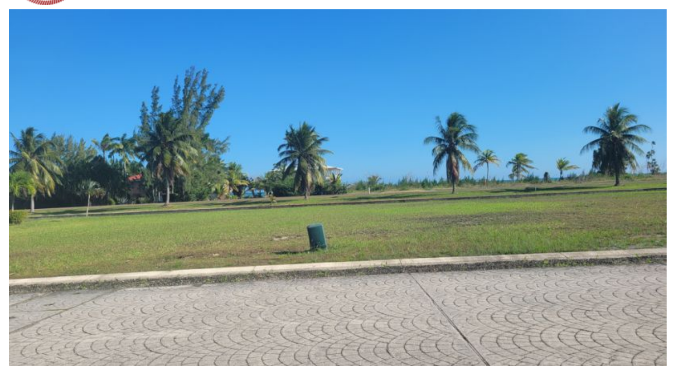
L558 – THE PLACENCIA RESIDENCES – OCEAN VIEW PARCEL 1459