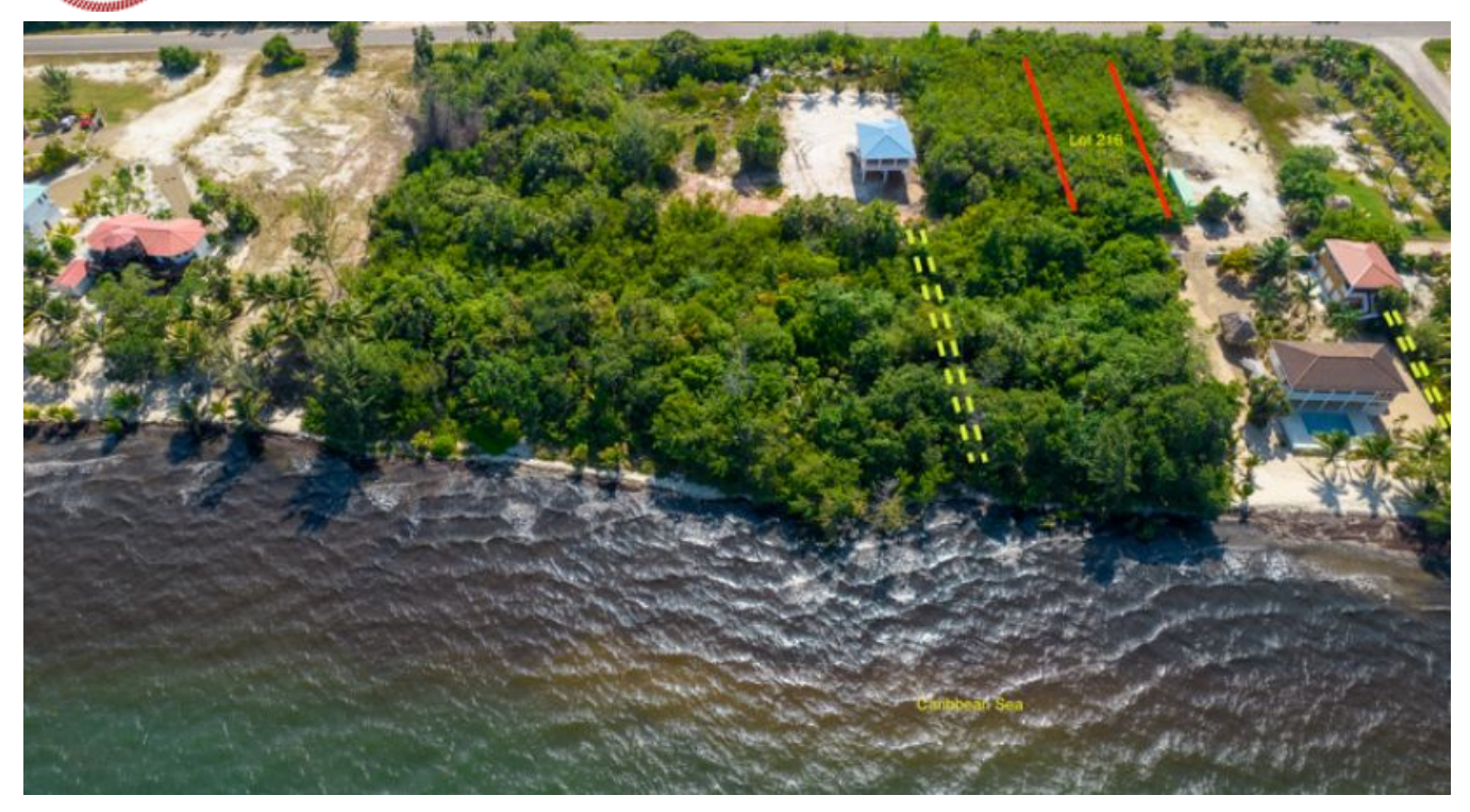
L519 - ROAD FRONT CARIBBEAN WAY LOT FOR SALE!