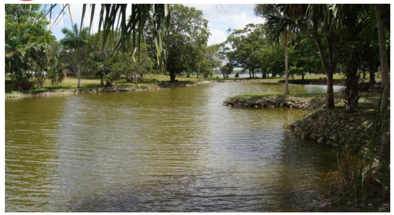
TWO - BEAUTIFUL ONE ACRE LAGOON VIEW PARCELS IN PROGRESSO VILLAGE, COROZAL