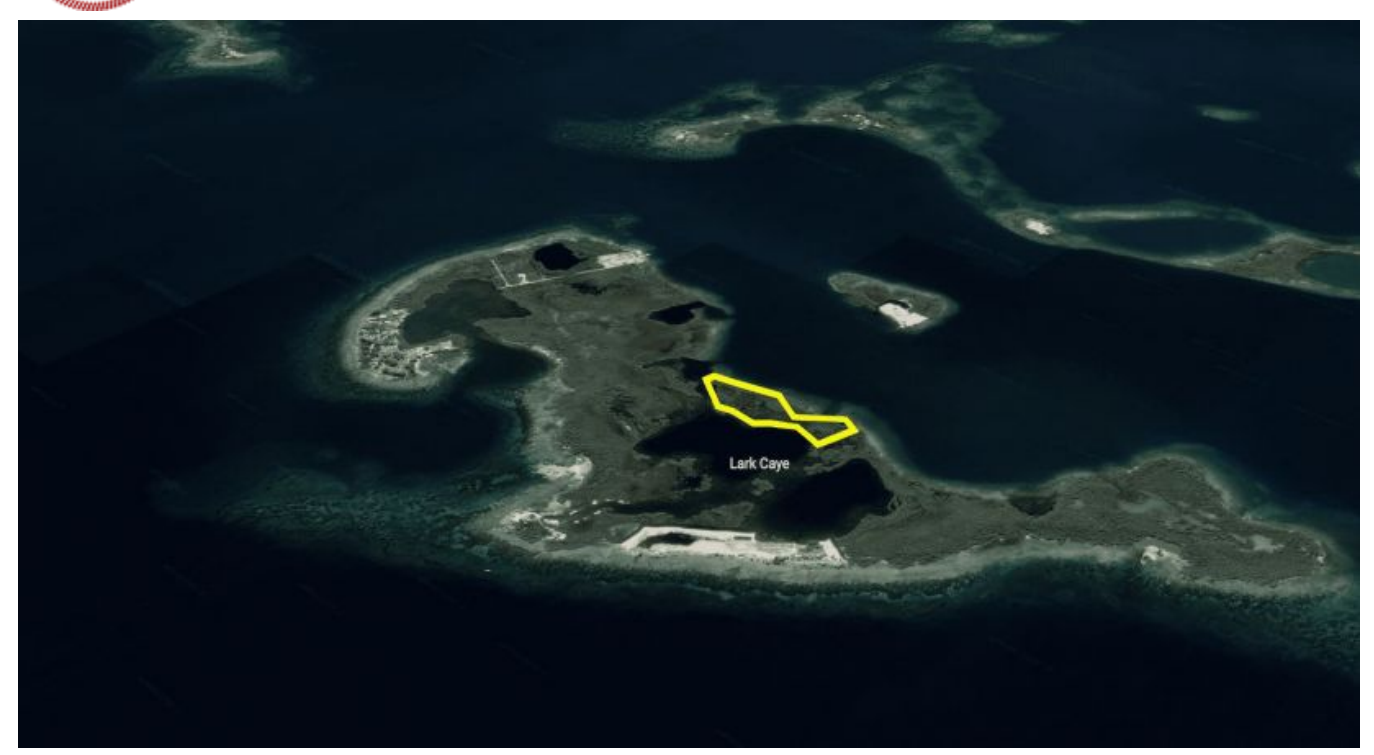
REDUCED! 5.3 ACRES, LARK CAYE, 5 MILES E. OF PLACENCIA/SEA & LAGOON FRONTAGE