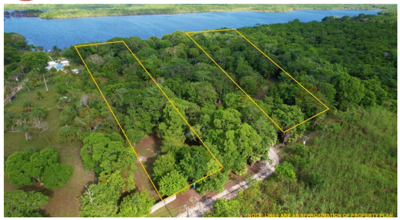
TWO - 1.9 ACRE LAGOON FRONT LOTS IN PROGRESSO VILLAGE, COROZAL DISTRICT