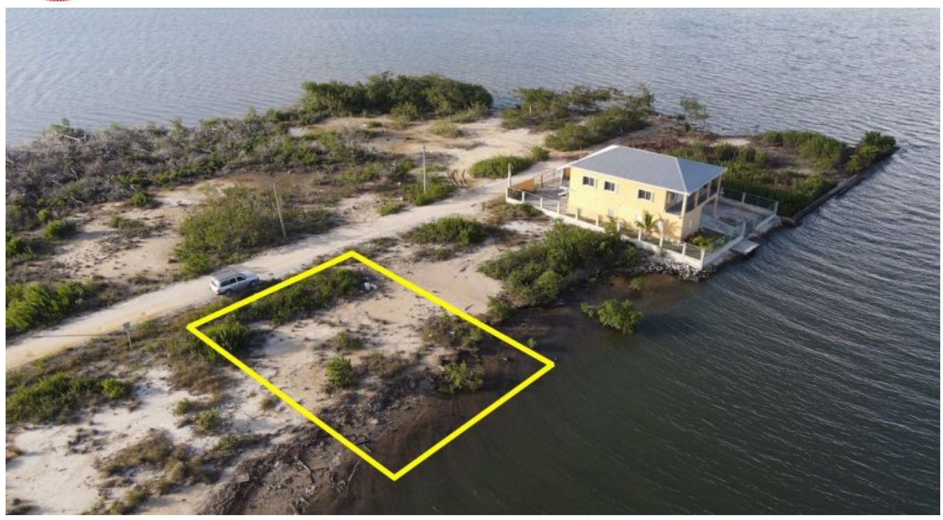
100 FT. X 100 FT. WATERFRONT LOT WITH VIEWS OF THE CARIBBEAN SEA, VISTA DEL MAR