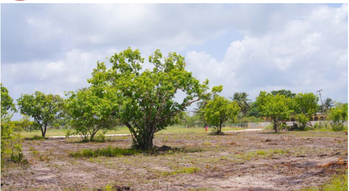
6 PARCELS - SUBDIVIDED RESIDENTIAL PROPERTY IN BURRELL BOOM